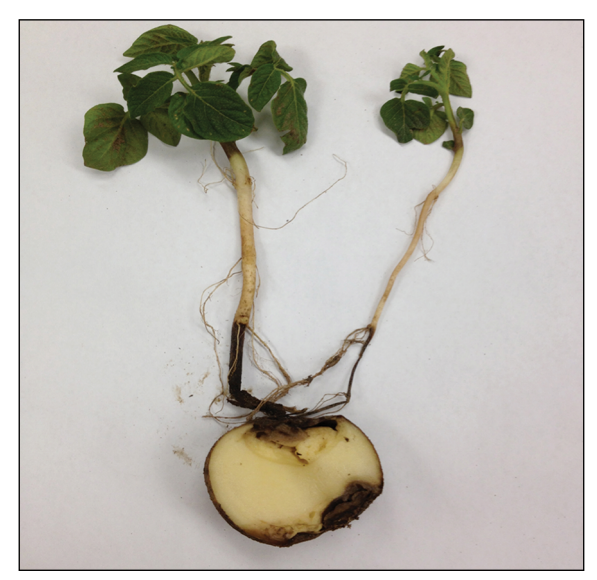
Figure 2. Blackleg symptoms progressing from the decaying seed piece to the base of the stem. (Michigan State University)

Blackleg is caused by either Dickeya spp. or Pectobacterium spp. Blackleg symptoms appear as black lesions at the base of the stem that can quickly girdle the stem as they expand upward. Unlike tuber soft rot, infected plant stems have a black appearance (Figure 2). Affected tissue becomes soft and water soaked under humid conditions. Infected stem lesions can rapidly expand causing brown to black decay that can affect the entire stem and lead to plant death. Affected plant stems appear stunted and leaves of infected plants become chlorotic and tend to roll upward at the margin as the disease progresses. Under dry conditions, symptoms are expressed as yellow, stunted and wilted plants with shriveled infected black tissue restricted to the area around the base of the stem near the soil surface.