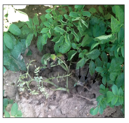
Figure 4. Aerial stem rot: Affected stem tissue become desiccated under dry conditions, resulting in a dry, brownish to black shriveled stem.