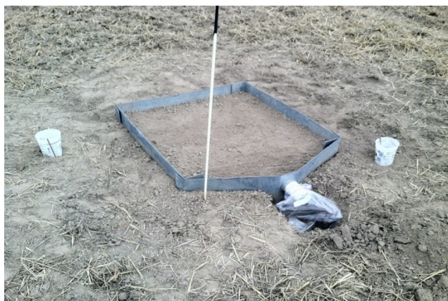
Figure 3. Runoff plot components.

The field was divided into two blocks with three runoff plots of each treatment in each block (fig. 2). In each block, each in-line-drop plot had a booms plot parallel to it, forming a pair of measurements whenever runoff data was collected. Differences in runoff between the two drop types