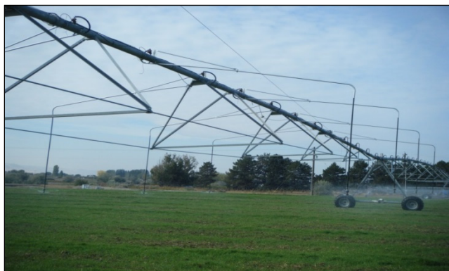
Figure 1. A part of the linear move system fitted with booms for the sprinkler runoff tests in 2013.

A 148-m long linear move irrigation system (Valley 8000 Series model, Valley, Neb.) was used for this experiment. Originally, the system had all its drops directly underneath the lateral. The system was modified to include alternating booms at positions shown in figure 2. The drops for the booms were moved 4.6 m from the lateral using